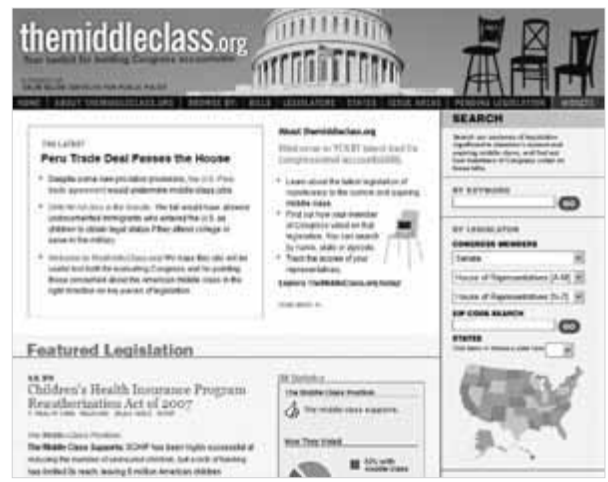
Figure 13. Holding Congress accountable is the goal of TheMiddleClass.org.

each spending bill breaks down the exact amount of money requested, location of where the money is to be spent, purpose of the expenditure, and the member who made the request. By delving into the nitty-gritty, you can gain a compelling picture of the money appropriated by Congress and who benefits from congressional support.