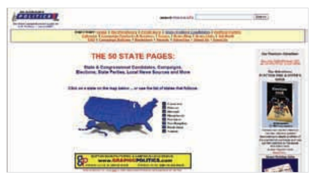
Figure 4. Politics1 provides updated news from across the country about presidential and congressional candidates.

option=com_wrapper&Itemid=205] has created a very useful website called Can I Vote [http://www.canivote.org] — a step-by-step guide on what you need to know to vote for the upcoming election. (See Figure 2.)