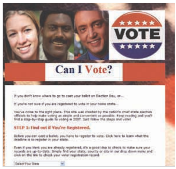
Figure 2. The CanlVote website lets you make sure you're registered, find your polling place, and more.