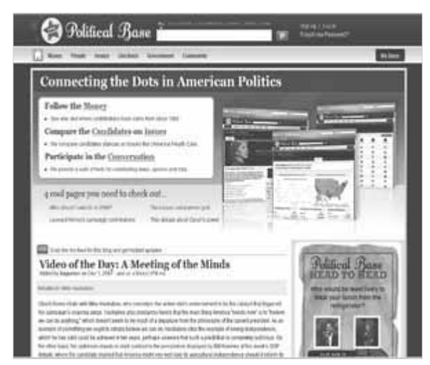
Figure 14. The Political Base wiki encourages discussion, participation, and research

You will also find a chart of fundraising activities for the year, a graphic of the U.S. that highlights support by state, as well as a listing of monies by state and by metropolitan area. You might be surprised to see which states and metropolitan areas support