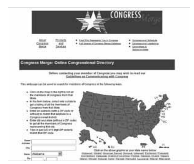
Figure 8. Find out the voting records of the current House and Senate members who serve your state.

Project VoteSmart [http://www.votesmart.org/official_five_categories.php?dist=voting_category.php] arranges the votes by topic/issue, by date, by bill title, and by how the member voted. How this site decides which votes to highlight and where the information has been obtained is provided in a detailed explanation [http://www.votesmart.org/voting_category_about.php]. Project VoteSmart provides a link to the bill, the sponsor, and statements made on the bill by the member. It has done a nice service by collecting key votes on specific topics.