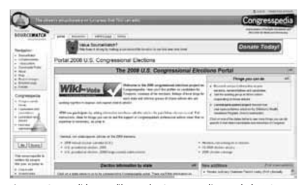
Figure 6. Get candidate profiles on the Congresspedia portal, the US Congressional Portal.

Project VoteSmart also collects and displays performance evaluations from special interest groups. The ratings reflect how often members of Congress have voted with the organization's position on key legislation. Granted the special interest group has a particular viewpoint and bias, but that might help you in matching your own beliefs and views on issues with those of candidates. For example in 2006, Speaker Nancy Pelosi received a rating of 100% on labor issues from the American Federation of