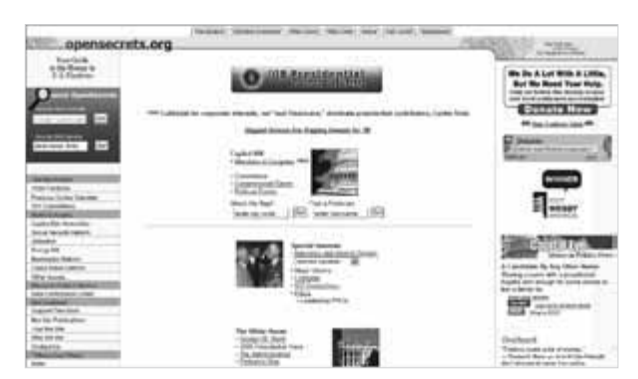
Figure 10. OpenSecrets provides head-to-head comparisons of the candidates in every 2008 U.S. House and Senate race.

related keywords and terms. It also provides you with a list of related legislation, complete with the title of the bill, the bill number, link to the full text of the bill, and its status. Turn your search into an RSS feed and monitor a bill as it makes its way through the 110th session of Congress.