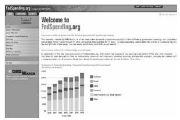
Figure 12. Find out how the government spends your hard-earned money at FedSpending.org.

Taxpayers for Commonsense has created a database of earmarks for this year's congressional spending bills [http://www.taxpayer.net/budget/fy08appropschart.html]. The database for