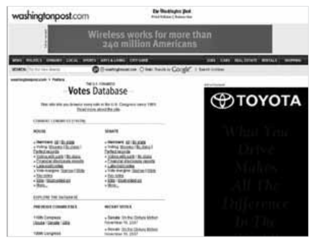
Figure 9. Washingtonpost.com's Votes Database has the voting records of House and Senate members back to 1991.