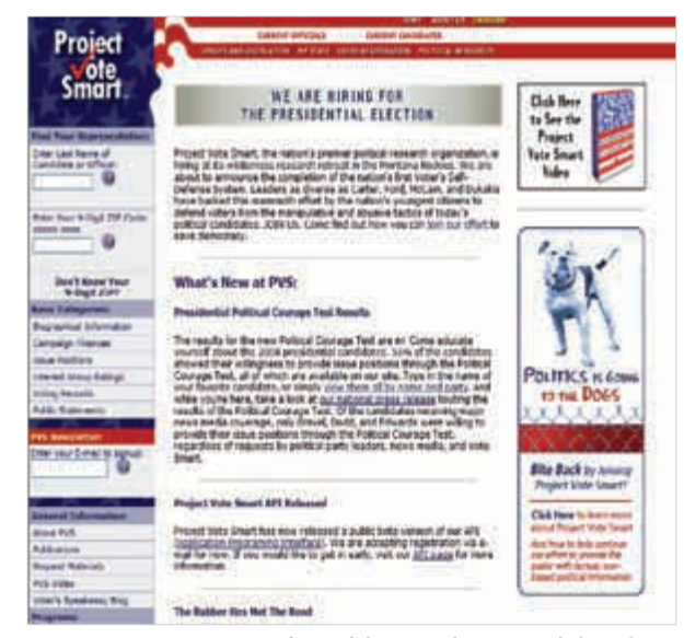
Figure 5. Project VoteSmart asks candidates to take a test and share their opinions on the issues important to voters.