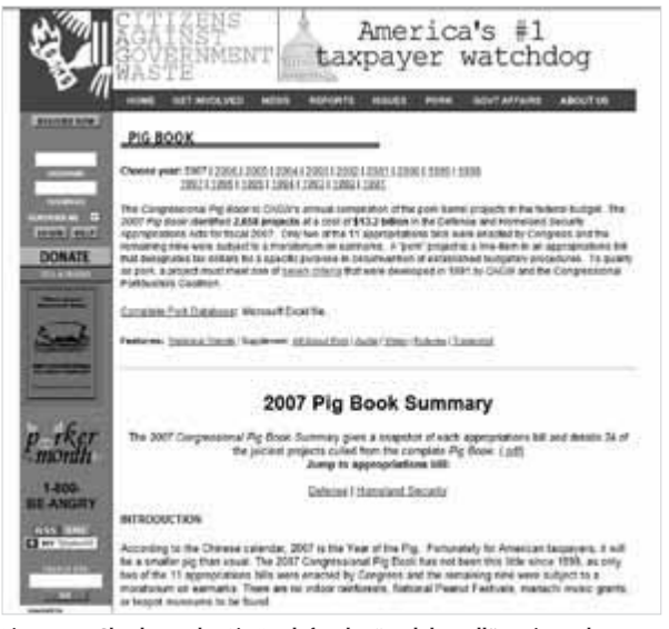
Figure 11. Check out the Pig Book for the "pork barrell" projects that were stuffed into the 2007 federal budget.

Now that you have found out who supports your representative/senator, you might also want to tie that knowledge to what legislation has been introduced affecting specific industries, organizations, and individuals. More and more attention is being paid to the practice of earmarks —a practice in which a representative/senator will insert spending provisions into a bill that directs taxpayer dollars to be spent on specific projects. It differs from a bill that appropriates money for spending by a specific government agency, in which the agency has the discretion as to where and how the money is spent [http://www.source watch.org/index.php?title=Earmarks]. Earmarking has grown in popularity during the last 30 years but recently has grabbed the attention of watchdog groups, including the Citizens Against Government Waste [http://www.cagw.org/site/Page Server?pagename=homepage], OMBWatch [http://www.omb watch.org], The Sunlight Foundation [http://earmarkwatch. org], and the Taxpayers for Common Sense [http://www.tax payer.net]. All these groups provide a healthy dose of sunshine on the earmarking practices of members of Congress. Citizens