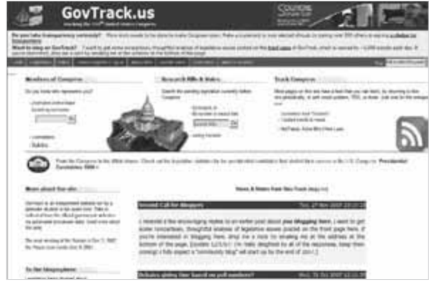
Figure 7. GovTrack.us follows the accountability trail.

State, County & Municipal Employees [http://www.votesmart.org/issue_rating_detail.php?r_id=3702]. In the same year, however, Pelosi received a rating of 0% from the Gun Owners of America [http://www.votesmart.org/issue_rating_detail.php? r_id=3606]. Click on the links for the organizations. Project VoteSmart provides a table of the ratings for every member of Congress and how well he or she supports the interests of the organization in that year. You can also learn a lot about your representative or senator by reading his or her public statements on key issues and topics. Project VoteSmart has put together full text of the public statements of members of Congress back to January 2006. Read for yourself what your representative or senator has had to say on your topic of interest.