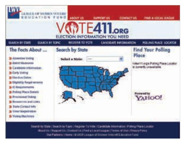
Figure 3. The League of Women Voters created this site in 2006, where you can register to vote.