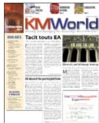
KMWorld Village is sponsored by KMWorld Magazine

To view KMWorld Village Booths refer to the Exhibit Hall floor plan on the overleaf.