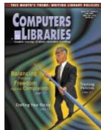
E-Libraries Village is sponsored by Computers in Libraries magazine

This section of the Exhibit Hall is reserved for providers of online library systems and closely related services. E-Libraries attendees are your highest-quality prospects by virtue of their presence at the meeting, and the E-Libraries Village is always a favorite stop for them.