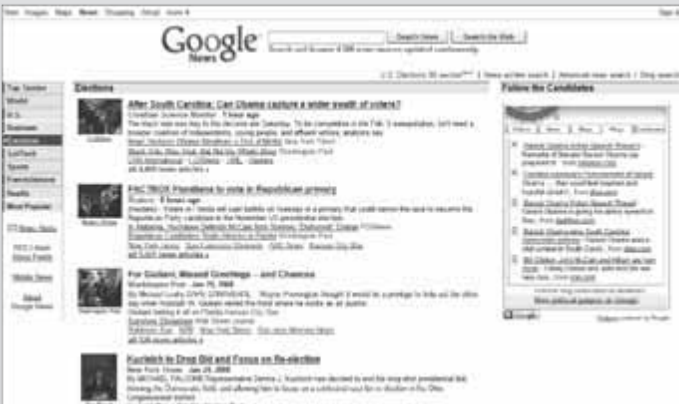
Figure 12. Google News, U.S. Election 08 (Accessed Jan. 27, 2008.)