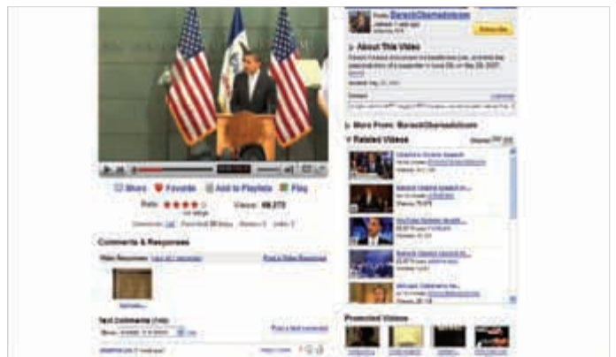
Figure 6. Under the topic of '08 Health Care, YouChoose lets you submit comments and responses to the candidates video statements – in this instance Barack Obama's position on healthcare. (Accessed Jan. 27, 2008.)