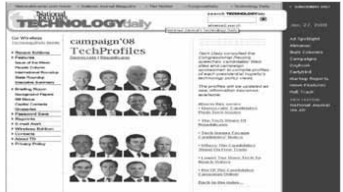
Figure 16. National Journal's Tech Daily Campaign '08 Tech Profiles for both the Democratic and Republican candidates (Accessed Jan. 27, 2008.)

The wide range of issues that PollingReport.com considers to be facing the nation include problems and priorities, abortion, budget and taxes, crime, disaster preparedness and relief, edu-