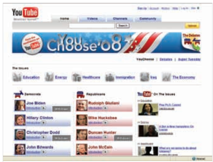
Figure 4. YouTube — YouChoose '08 lists the Republican and Democratic candidates running for president in 2008. (Accessed Jan. 27, 2008.)

post his or her own videos, questions, and issues to the candidates, which “provides a platform for people to engage in dialogue with candidates and each other through the use of community features such as video responses, text comments and ratings” [ http://youtube.com/press_room_entry?entry=v-gjuVQrwIk ]. The site lists six issues (education, energy, healthcare, immigration, Iraq, and the economy) and the responses of the candidates who have submitted videos on those issues. Each candidate has a separate “channel” and, even though some candidates have since withdrawn from the campaign, their videos remain available for viewing.