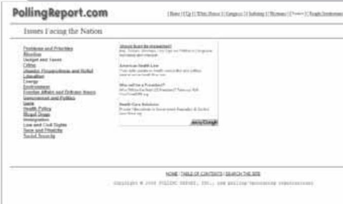
Figure 22. PollingReport.com — Issues Facing the Nation (Accessed Jan. 27, 2008.)