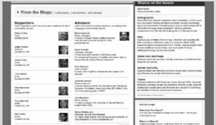
Figure 15. CNN Politics.com's ElectionCenter 2008 Primaries and Caucuses shows Barack Obama's views on the issues. (Accessed Jan. 27, 2008.)