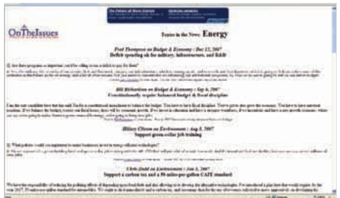
Figure 3. OnTheIssues shows what policies the candidates would implement concerning big business and energy-efficient technologies. (Accessed Jan. 27, 2008.)