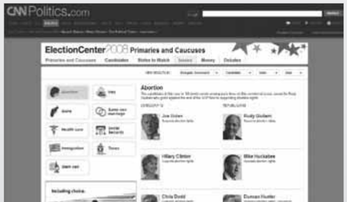
Figure 14. On CNN Politics.com's ElectionCenter 2008 Primaries and Caucuses, view the list of issues CNN has chosen to highlight. (Accessed Jan. 27, 2008.)