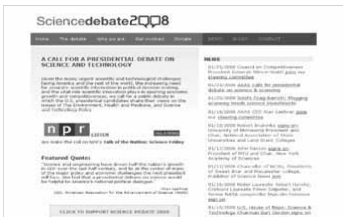
Figure 29. Science Debate 2008 (Accessed Jan. 27, 2008.)

policy forums, and information on a broad range of domestic and foreign policy questions.” To extend the reach of Opportunity 08, Brookings has teamed with ABCNews.com and ABC News Now to reach beyond the policy community — to connect with the American public to provide reports, analysis, and information on the different issues facing the next president. The list of issues is broad-based and wide-ranging, arranged by categories: Our World [ http://www.brookings.edu/projects/opportunity08/Our-World.aspx ], Our Society [ http://www.brookings.edu/projects/opportunity08/Our-Society.aspx ], and Our Prosperity [ http://www.brookings.edu/projects/opportunity08/Our-Prosperity.aspx ]. Each issue comes with a thoughtful statement of the problem and possible solutions. Additional commentary and research are also made available. This is a useful site designed to get beyond the bitter partisanship that has divided presidential politics for too long.