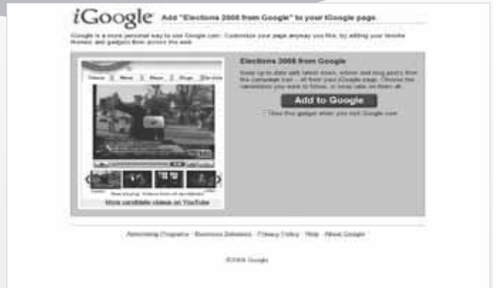
Figure 13. Google's 'Follow the Candidate' widget can be added to your iGoogle page. (Accessed Jan. 27, 2008.)