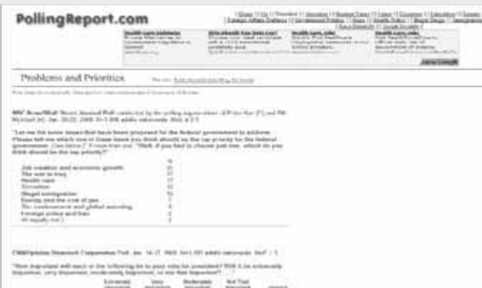
Figure 23. PollingReport.com's 'Problems and Priorities' (Accessed Jan. 27, 2008.)