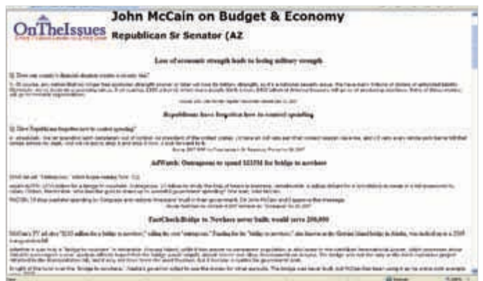
Figure 2. John McCain's views on the budget and the economy from OnTheIssues. (Accessed Jan. 27, 2008.)