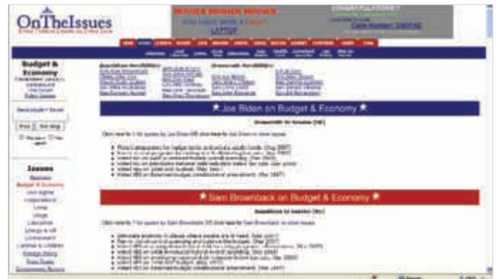
Figure 1. The OnTheIssues site features the positions of the candidates, arranged alphabetically, concerning the budget and economy. (Accessed Jan. 27, 2008.)

The site does, however, have some problems. The 2008 election information needs to be put at the top of the page. Links to