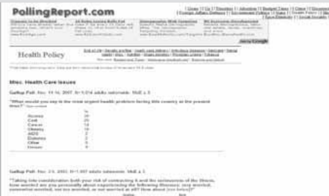
Figure 24. PollingReport.com highlights miscellaneous healthcare issues. (Accessed Jan. 27, 2008.)