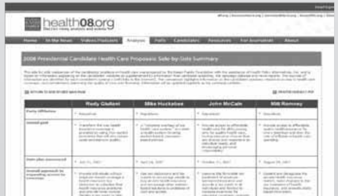
Figure 27. Healthcare08.org presents a healthcare issues comparison between Giuliani, Huckabee, McCain, and Romney. (Accessed Jan. 27, 2008.)