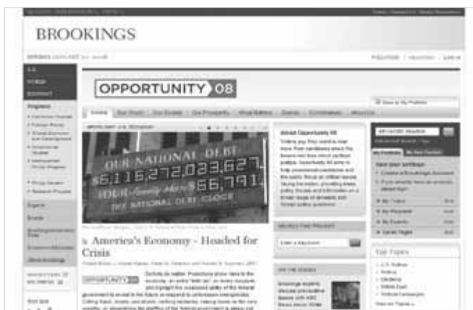
Figure 28. Brookings and ABC News Opportunity 08 website. (Accessed Jan. 27, 2008.)