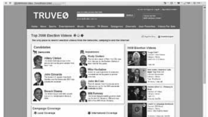
Figure 8. Truveo's Election Video portal includes campaign videos from major television networks, popular user-generated video sites, and the campaigns' own websites. (Accessed Jan. 27, 2008.)

Are you interested in technology issues and the presidential campaign? Technology is not one of the primary issues that have garnered a great deal of attention from the mainstream press. National Journal's Tech Daily has put together a useful site that addresses technology-related issues for both Republican and Democratic presidential candidates. Campaign 08 Tech Profiles [ http://nationaljournal.com/about/technologydaily/candidates07.html ] has been compiled from "the Congressional Record, speeches and statements on campaign web sites. Technology Daily also contacted the campaigns for information on a series of technology-related issues, but not all of them