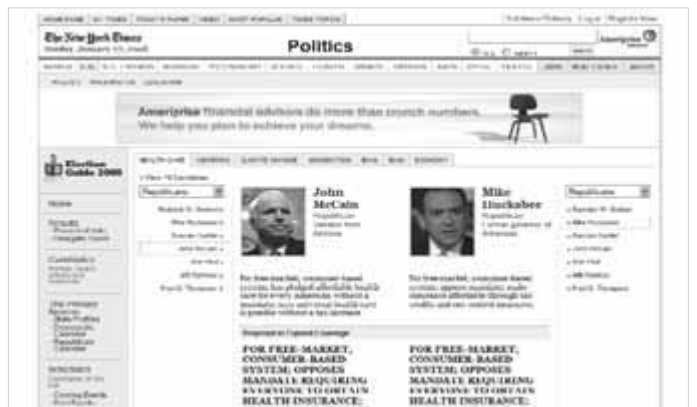
Figure 18. The New York Times Election Guide 2008 compares John McCain and Mike Huckabee's views on the subject of healthcare. (Accessed Jan. 27, 2008.)