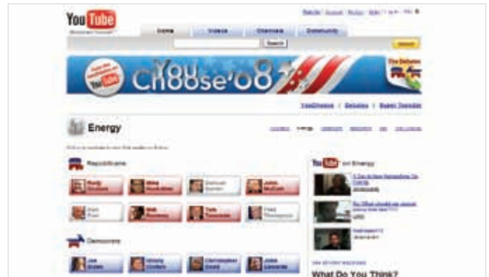
Figure 5. Go to YouChoose '08 Issue: Energy to view Republican and Democratic candidate videos on the issue of energy. (Accessed Jan. 27, 2008.)