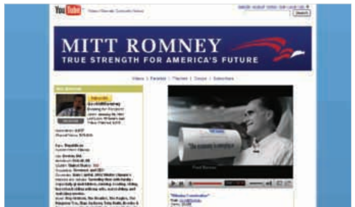
Figure 7. Check out Mitt Romney's 'Channel' on YouChoose for brief biographical information, along with videos. (Accessed Jan. 27, 2008.)