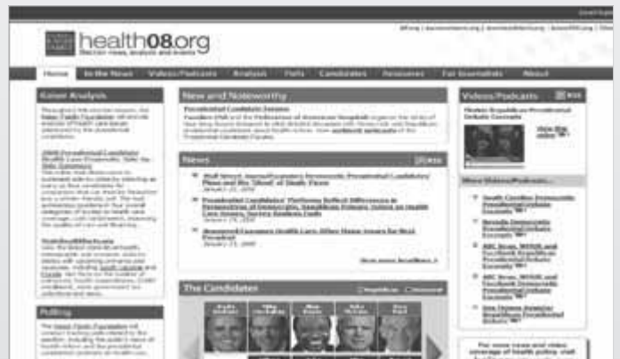
Figure 26. The Kaiser Family Foundation's website, Health08.org, provides resources and information about health policy issues in the 2008 election. (Accessed Jan. 27, 2008.)