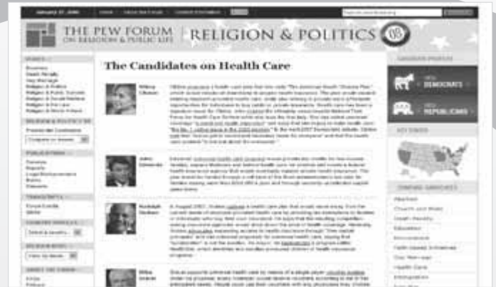
Figure 25. Pew Forum on Religion and Public Life — Religion & Politics '08 looks at the candidates' proposals on dealing with healthcare. (Accessed Jan. 27, 2008.)