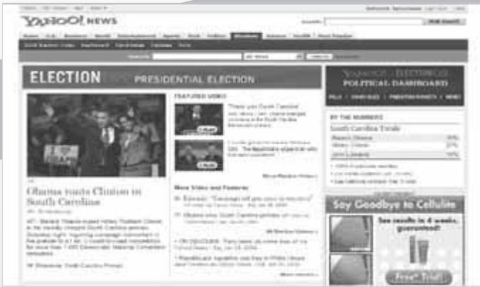
Figure 10. The Yahoo! News Election 08 Presidential Election news portal (Accessed Jan. 27, 2008.)