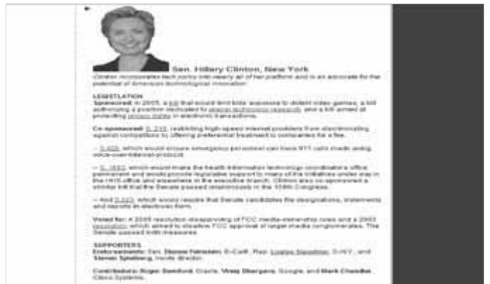
Figure 17. National Journal's Campaign 08 Tech Profiles – Hillary Clinton (Accessed Jan. 27, 2008.)