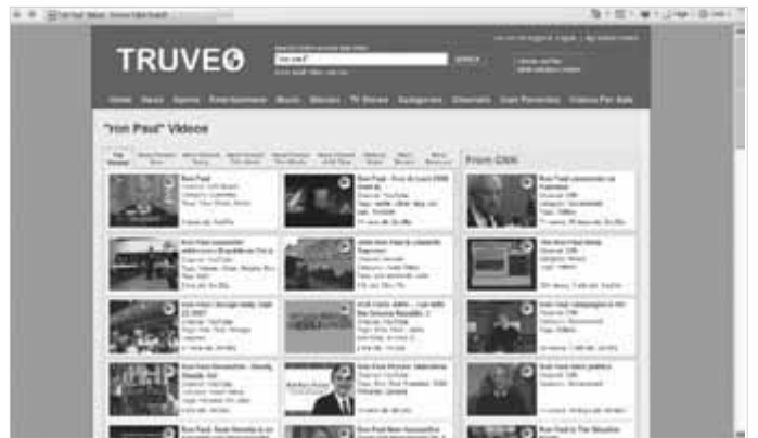
Figure 9. You can do a 'Ron Paul' search on Truveo for videos of his campaign and his mention in the mainstream press and popular user-generated videos. (Accessed Jan. 27, 2008.)

responded. The information from those who did is incorporated here." (See Figure 16 on page 47.)